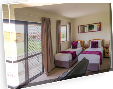
Garden Studio Twin

(Accommodates up to 3 people or 2 adults and 2 small children)