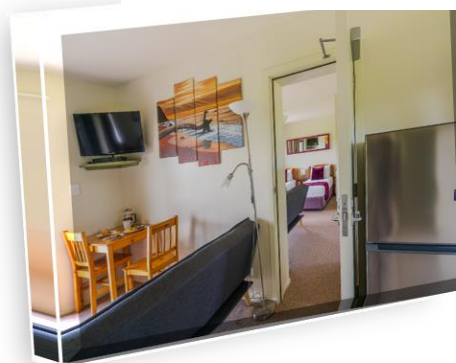
Family Garden Studio

(Accommodates up to 3 people or 2 adults and 2 small children)