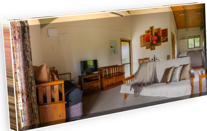
Two Bedroom Family Cottage (Accommodates up to 7 people)

Bedding configurations can be changed to suit your requirements.