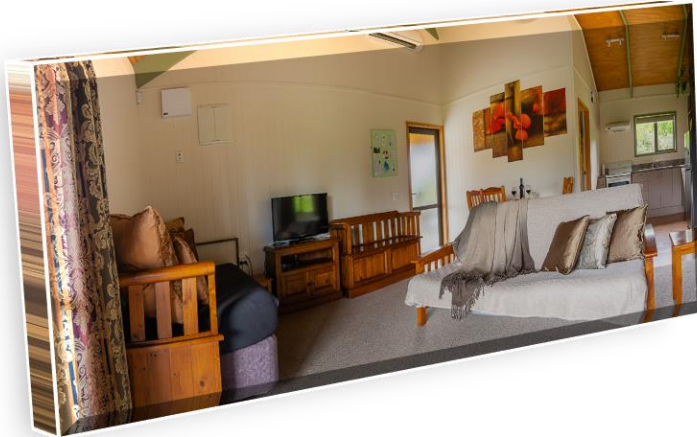
Two Bedroom Family Cottage (Accommodates up to 7 people)

Bedding configurations can be changed to suit your requirements